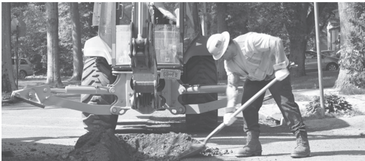
Gas Modernization Program – May 26, 2016, Montclair, NJ

Our strong balance sheet is one key to our financial strength. We continue to maintain a solid financial profile capable of meeting our growth objectives, without diluting our current shareholders through the issuance of new equity.