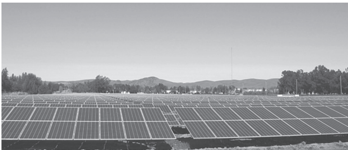
Lawrence Livermore National Laboratory – April 26, 2016, Livermore, CA